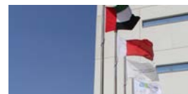
UAE National Day Celebration Program p7