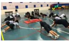
Dubai 30x30 at GIS p5