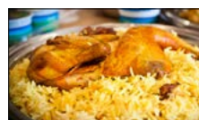
Special Lunch menu on 28 November National Day p5