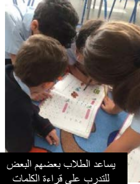
يساعد الطلاب بعضهم البعض للتدرب على قراءة الكلمات الجديدة