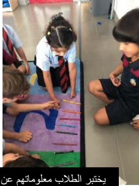
يختبر الطلاب معلوماتهم عن الألوان

في صفوف غير الناطقين بالعربية يستكشف الطلاب في الصف الأول أصوات الحروف، مع تعلم الأرقام وأيام الأسبوع والألوان، وكل ذلك من خلال الأغاني. وطلاب الصف الثاني يُطورون مهارات القراءة والكتابة والاستماع والتحدث من خلال استكشاف أجزاء المنزل. بينما الصف الثالث يستكشفون أنواعًا مختلفة من الأطعمة، والاشتراك في مُحادثاتٍ صغرى لتدريبهم على طلب الطعام في المطعم مُستقبلًا. والصف الرابع يتعلمون عن الجنسية والبلدان التي قَدِموا منها وطريقة السفر من مكانٍ لآخر، بينما في الصف الخامس يستكشفون كيفية وصف عاداتهم اليومية من خلال مهارتي الكتابة والتحدث.