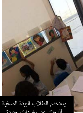
يستخدم الطلاب البيئة الصفية للبحث عن مفردات جديدة ومعانيها