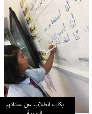
يكتب الطلاب عن عاداتهم اليومية

نحن نقدر مشاركة أولياء الأمور، ونهدف إلى تحسين عملية التواصل بين أولياء الأمور وقسم اللغة العربية. ونُدرِك تمامًا دور المشاركة الأسرية الفعالة لتحسين الطالب دراسيًا، وأيضًا خلق مجتمعٍ مدرسيٍّ قويٍّ. نحن نتمنى فعليًا مشاركتكم ونفاغلكم معنا داخل الصف من خلال بعض الأنشطة التي يمكنكم تقديمها في صفوف اللغة العربية مثل: قراءة كتاب، أو طبخ أكالاتٍ بسيطةٍ وشرح مكوناتها أو أي خبراتٍ أخرى تشعرون أنها ستساعد في تطوير مستوى الطلاب في اللغة العربية. إذا كانت عندكم الرغبة في ذلك الرجاء التواصل مع معلم اللغة العربية لطفلكم.