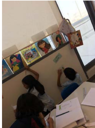
Students using the classroom environment to explore new words and their meaning.