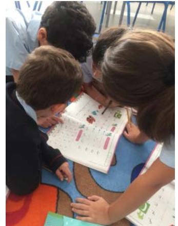
Students support one another as they attempt to read new words.

We strongly value parent-partnerships and aim to continue to enhance the communication between parents and the Arabic department. We recognize that parental engagement benefits students academic standing as well as builds a stronger community. We therefore welcome you into our classes should you like to engage with the students through reading a book, cooking, or any other experience you feel would support the students' Arabic development. If you are interested, please speak to your child's Arabic teacher.