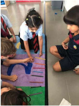
Students test their knowledge of colors in Arabic.

In Arabic B, our Grade 1 students have been exploring letter sounds along with learning numbers, days of the week and colors through song. Grade 2 students have been strengthening their reading, writing, listening and speaking skills through investigating the areas around the house. Grade 3 have been exploring different types of food and engaging in conversations to support ordering at a restaurant. Grade 4 students have been exploring their nationalities and the countries where they come from as well as mode of travel, and Grade 5 students have been exploring how to write and speak about their daily routines.